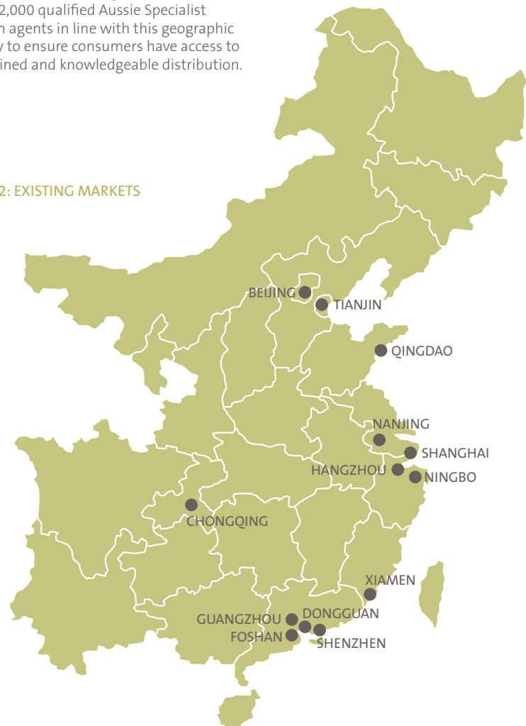
CHART 2: EXISTING MARKETS

Trade and distribution development will be the initial focus in new cities. Tourism Australia will build upon the strong distribution network of over 2,000 qualified Aussie Specialist Program agents in line with this geographic strategy to ensure consumers have access to well trained and knowledgeable distribution.