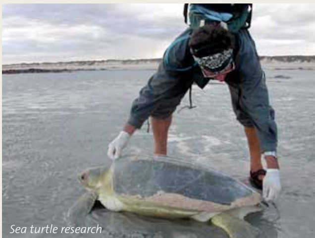
Sea turtle research

Further east, near Wyndham, the 36,000 hectare Parry's Lagoon attracts migratory birds come from as far as Siberia to feed, with the seasonal wetlands of the Ord River floodplain supporting large numbers of birds, providing habitat, breeding and food for 77 different bird species.